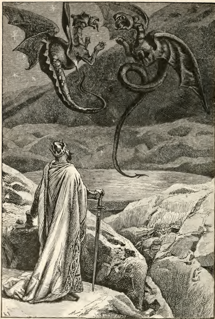
The Battle of the Dragons.